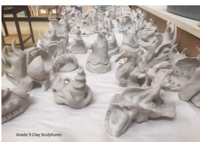
Grade 9 Clay Sculptures