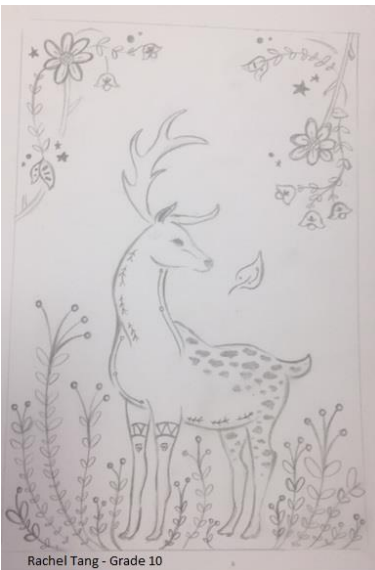
Rachel Tang - Grade 10