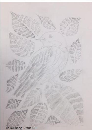
Bella Huang - Grade 10