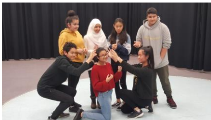
Drama students doing improv (see article on page 3)

There will be no classes for students on Friday, December 7 th as it is a P.A. Day. We look forward to seeing students back at school on Monday, December 10 th .