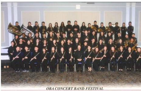
OBA CONCERT BAND FESTIVAL TORONTO ONTARIO 2019