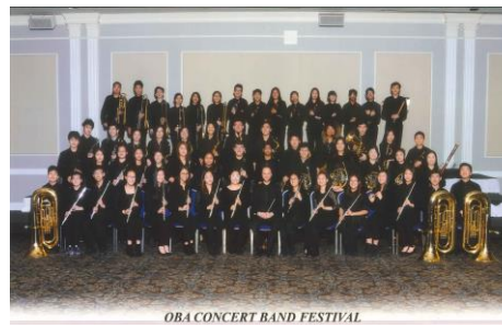
OBA CONCERT BAND FESTIVAL TORONTO ONTARIO 2019